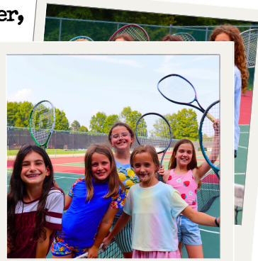
"We always have so much fun at tennis. It's our favorite activity!"

For the serious tennis player, private lessons are available. Each tennis lesson lasts 50 minutes and is tailored to the skill level of each camper. If you are a tennis competitor, you have the option to join one of Cayuga's Tennis Teams. Our teams compete in intercamp tennis matches against local camps, catering to various skill levels. All campers are welcome to participate, as there are no tryouts required. Last summer, our senior female campers made it to the Wayne County Intercamp semi finals.